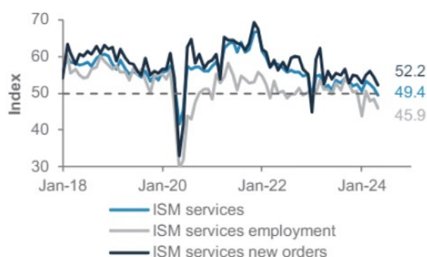
Chart 2; US ISM Services PMI

In the US, April non-farm payrolls were lower than expected at 175k (vs 240k expected), the second lowest print in the last 12 months. Year over year wage growth ticked down to a three year low of 3.9% (from 4.1%), helping to offset concerns over the slow last mile of the disinflation process. A downturn in US manufacturing and services activity, and new orders and employment components, also point to future labour market softness and a slowdown ahead in US consumption. Retail sales also cooled, with the core control group -0.3% in April vs 0.1% expected and 1.1% in the month prior. Lastly, May's Core PCE inflation data cooled to 0.3% month on month, in line with April, after 3 months of upside surprises in Q1.